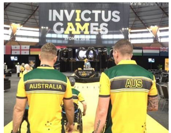
Invictus Games House (The Dome) Invictus Games Sydney 2018

Sydney Showground is situated within Sydney Olympic Park (SOP) on the traditional lands of the Burramattagal and Wangal People of the Eora Nation. Access and inclusion played a major role in the planning, design and delivery of the 2000 Olympic and Paralympic Games. It was also home to Invictus Games Sydney 2018 when the Dome was transformed into 'Invictus Games House' home to family and friends for the duration of the Games. This legacy has helped ensure our venues are accessible to all patrons.